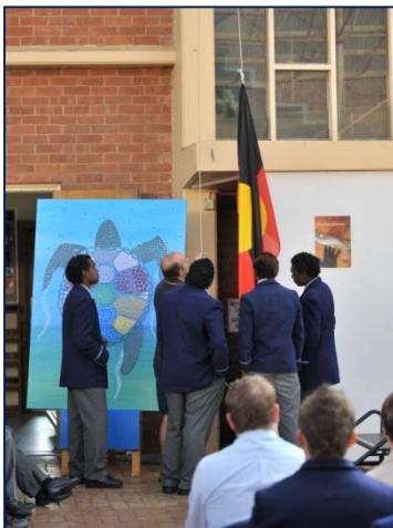
The Aboriginal Flag is raised as part of the Sorry Day Ceremony