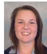
Adele Button Legal Studies