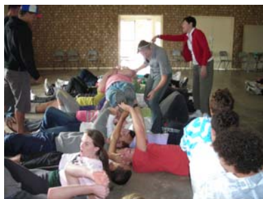
"It was a chance to take a step back and relax; whilst reflecting on the different aspects of life."